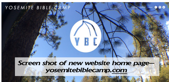
Screen shot of new website home page— yosemitebiblecamp.com

Contrary to fears, the fire was contained and did not cross Bass Lake Road/222, so YBC remained safe. We thank the firefighters for their valiant efforts, and praise God for His gracious protection and for the recent healing rains.