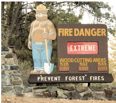
The Batterson Forest Fire Station sign, across Hwy. 41 from Sky Ranch Rd., is changed to alert travelers to fire danger levels year-round.

Parts of Oakhurst lost power, and Hwy. 41 was closed for a time between Hwy. 49 and Sky Ranch Road. The sheriff issued 13,000 evacuation orders, and others were warned should the winds shift and the fire change direction.